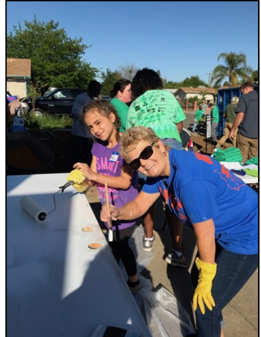
Above images: Rebuilding Together Day for Lincoln Village on Saturday, April 21 st , 2018