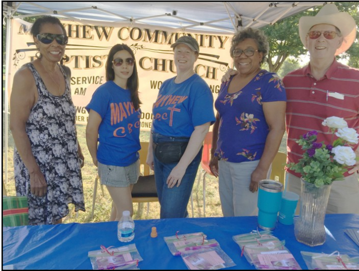
Above image: Rancho Cordova Recreation & Park's 60 th Anniversary "Party in the Park".