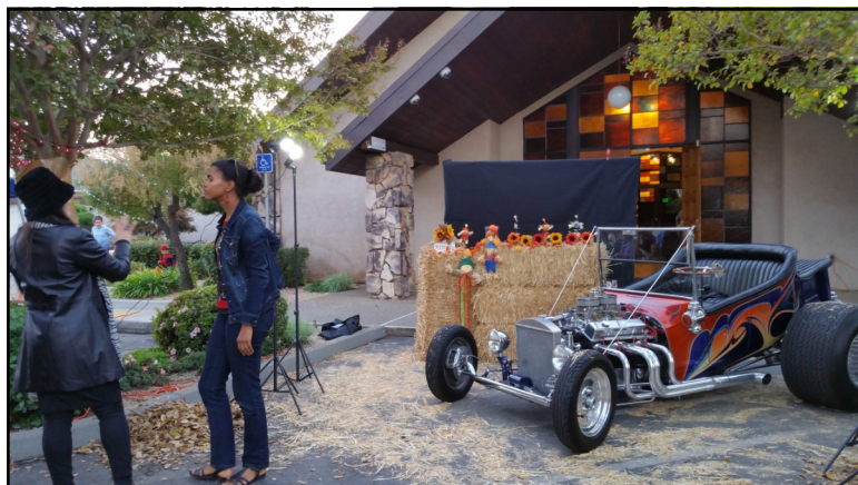
Doug's Hot Rod