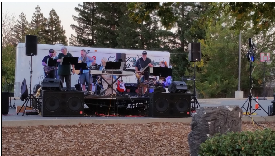
Mayhew CBC Band