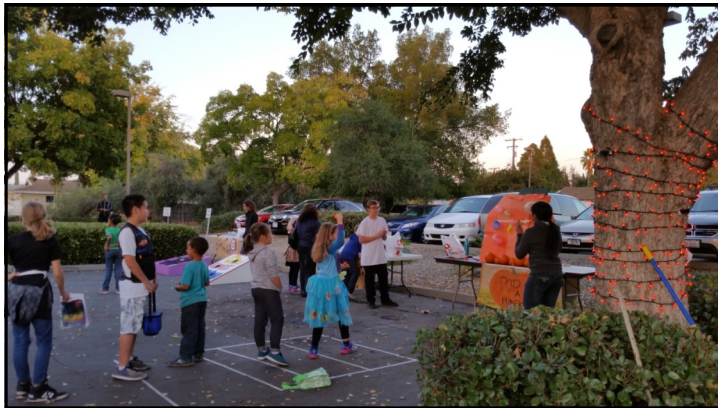
Lots of games, run by the older school kids

I would like to thank everyone who helped make our event successful. The ones who helped set up the lights, donated candies and baked goods, donated their time, money, setup, cleanup, or whatever, this event wouldn't have been a success without you.