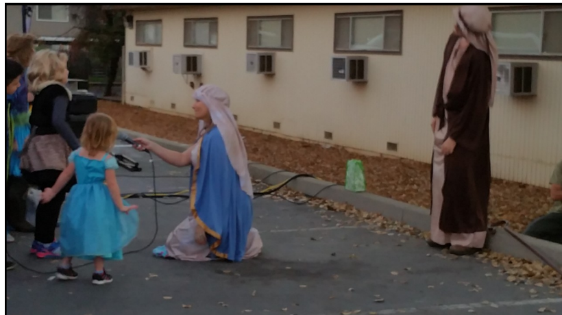
"Joseph and Mary" leading in Awana songs